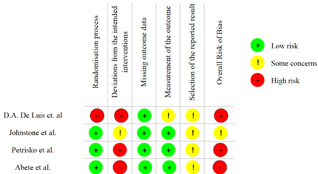
Figure 2. Risk of Bias

BMR as adjusted for physical exercise, dietary studies should calculate BMR via indirect calorimetry as recommend by other studies. 26, 33 Providing individualized diets through indirect calorimetry may have also solved the confounding bias present in all studies with a wide age range of participants (Table 3), the wide age range is deemed a confounding bias as BMR decreases linearly with age. 34 Furthermore, all participants had voluntarily signed up to be in all these studies, which meant that these were obese adults who were motivated enough to start dieting, which may prove less external validity of studies as obese adults in the general population may not be as motivated to diet and therefore possibly have different retention rates to the obese participants in these studies. Finally, the internal validity of the studies presented in this systematic review is low as a result of non-individualized caloric intakes, high risk of biases within studies (Figure 2), different dietary compositions and other aforementioned confounders. Studies with