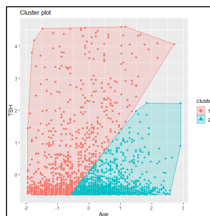
Figure 3. Cluster plot for female patients according to age and TSH

Evaluation of Data Related to Male Patients Male patients were grouped in two clusters, and when the effect sizes were evaluated, a